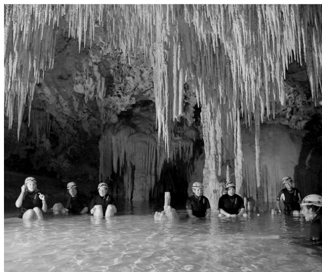
The cenotes or sinkholes found in the Yucatan Peninsula are sunken caves, which are the rarest of all types of caves, and are one of the great natural treasures of Mexico.