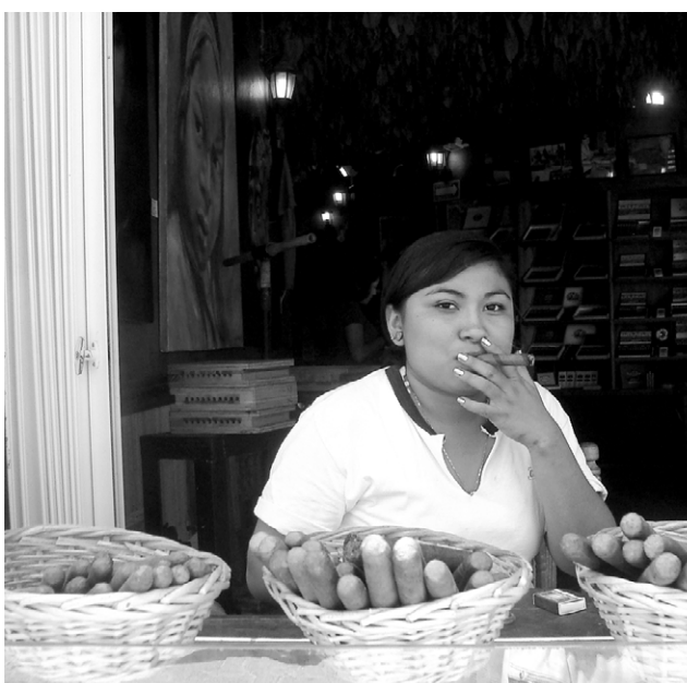
A cigar shop in Playa Del Carmen