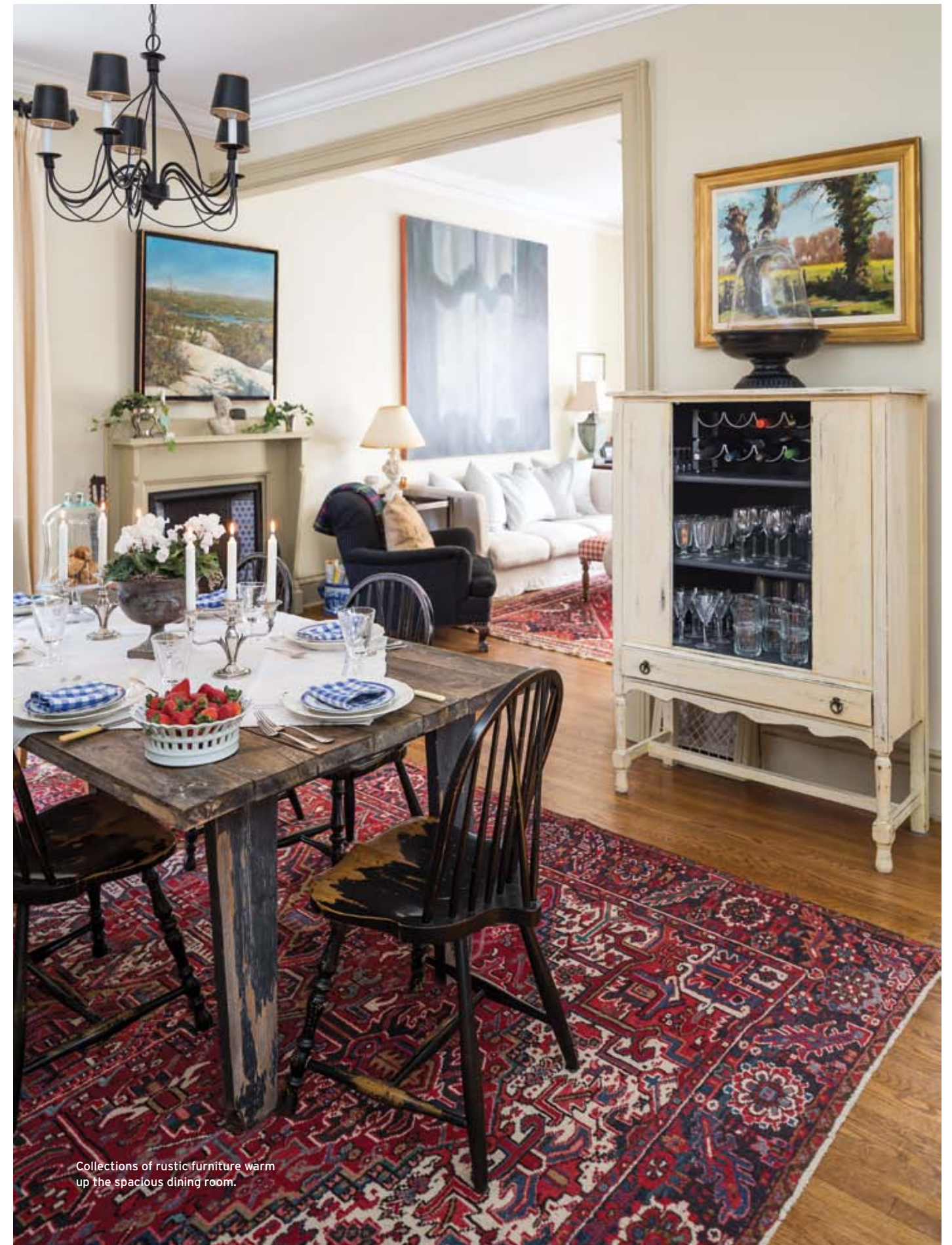
Collections of rustic furniture warm up the spacious dining room.