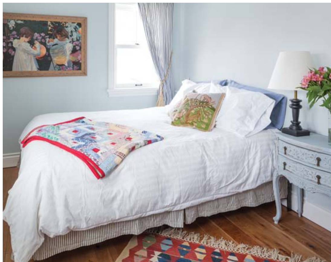
ABOVE: The built-in gas fireplace in the master bedroom is a perfect place to curl up. RIGHT: This newly added bedroom is a cosy retreat for guests.