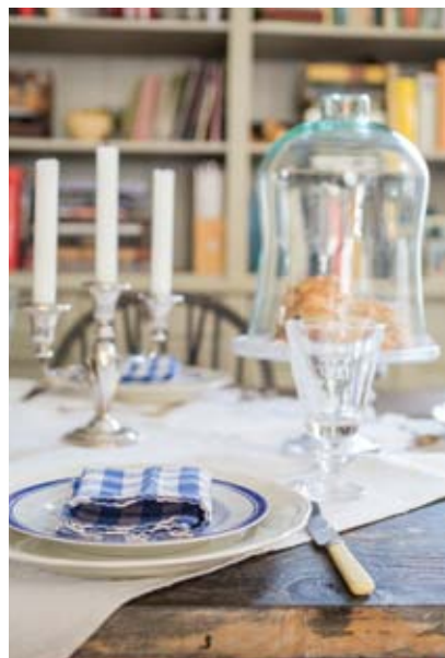
TOP: The beautifully crafted kitchen has everything Janette wanted, including lots of open storage to showcase dish collections. ABOVE: Collections from trips to France enhance table settings. RIGHT: The kitchen addition opens up the space and makes cooking easy in this organized space.