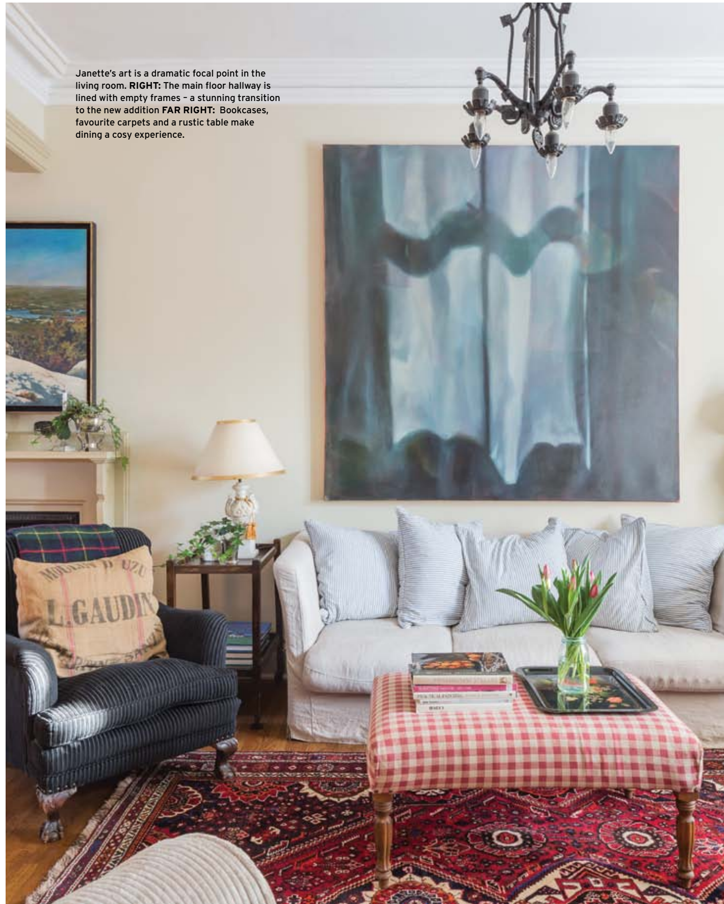
Janette's art is a dramatic focal point in the living room. RIGHT: The main floor hallway is lined with empty frames - a stunning transition to the new addition FAR RIGHT: Bookcases, favourite carpets and a rustic table make dining a cosy experience.