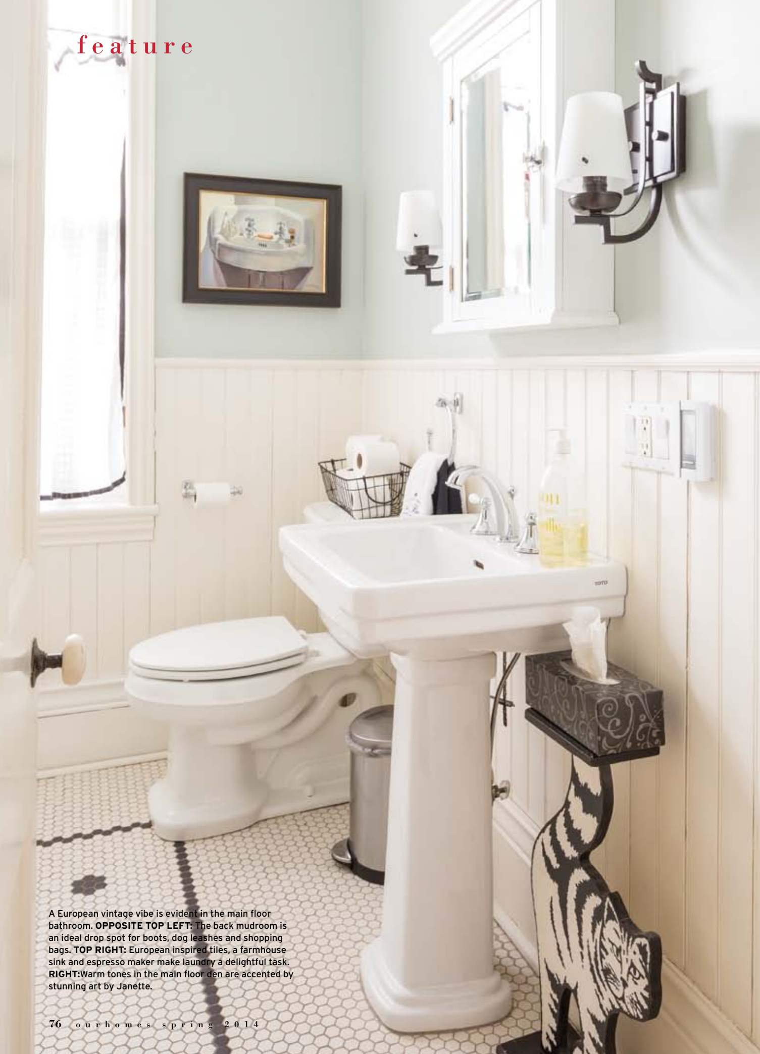
A European vintage vibe is evident in the main floor bathroom. OPPOSITE TOP LEFT: The back mudroom is an ideal drop spot for boots, dog leashes and shopping bags. TOP RIGHT: European inspired tiles, a farmhouse sink and espresso maker make laundry a delightful task. RIGHT: Warm tones in the main floor den are accented by stunning art by Janette.