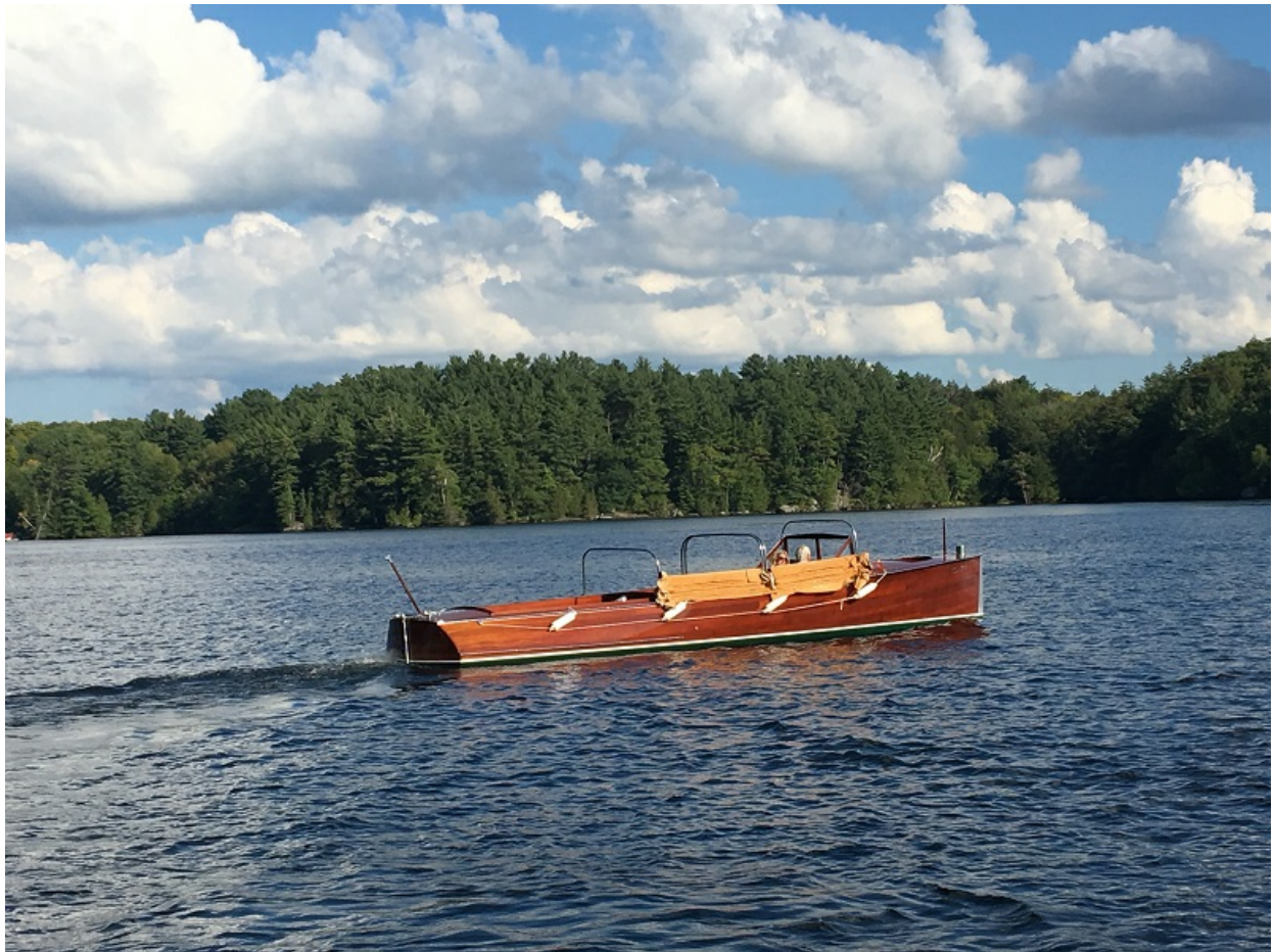
Traditional wooden 1913 boat

An evening wouldn't be complete in the Muskokas without a fireside chat around a fire pit with S'mores while we chatted and gazed at stars.