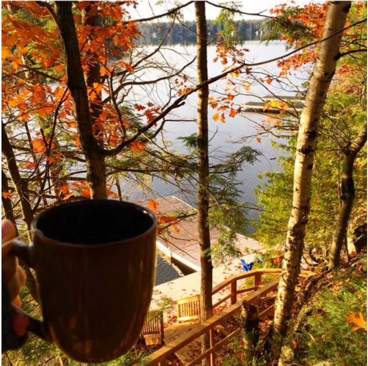
View of the dock at Muskoka Soul | Cliff Bay.

Muskoka Soul | Cliff Bay has luxurious details to ensure everyone enjoys themselves from the moment they wake up until it's time for stories around a bonfire. A well-stocked games room, high thread count sheets and comfortable, well-appointed rooms to snuggle into at the end of a full day are details everyone enjoys. For a large crowd, there is room to spread out and feel you can be on your own if you need space.