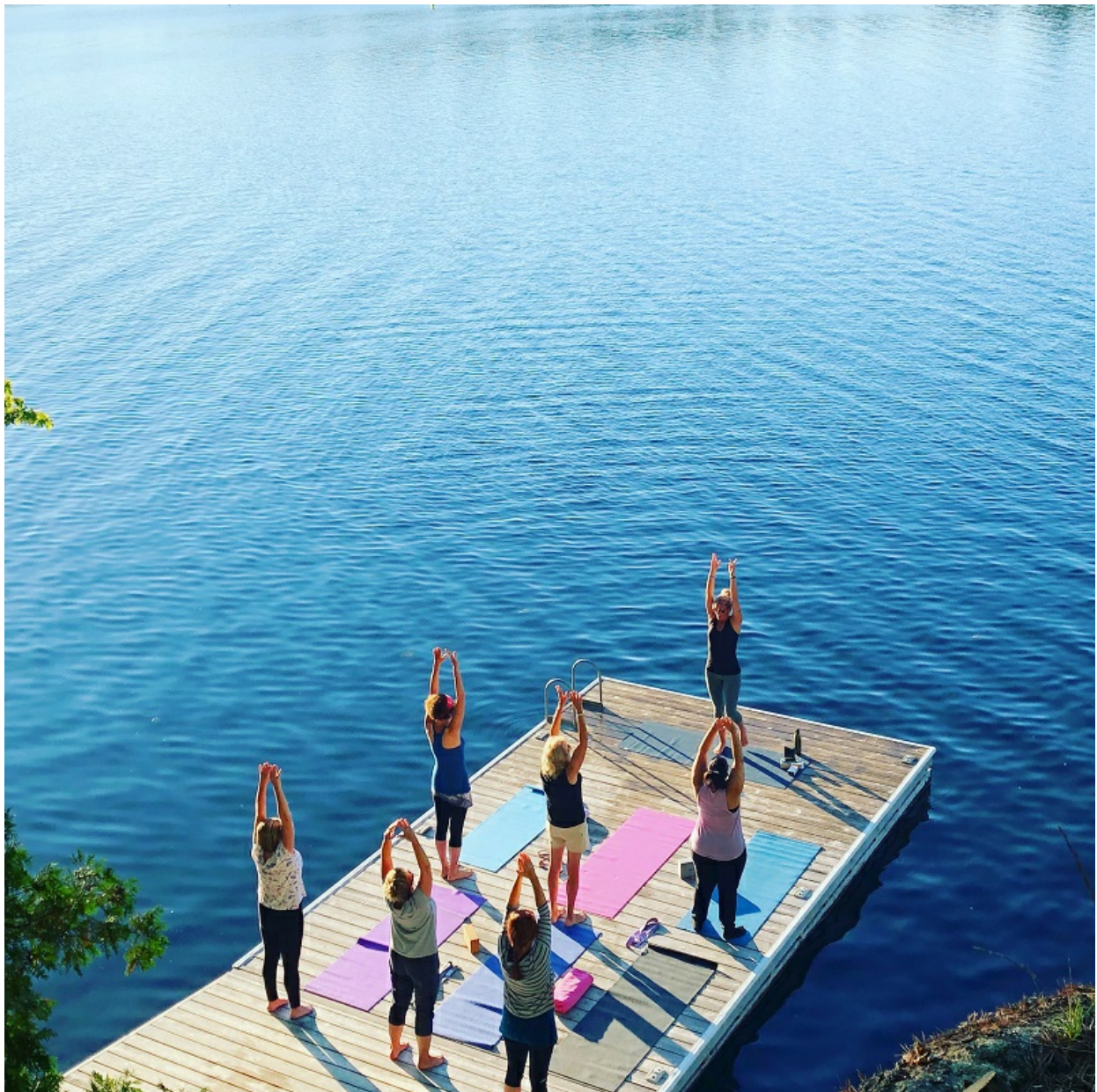
Morning yoga on the dock.

A look around Muskoka Shipyards Marketplace , filled to the rafters with items for every