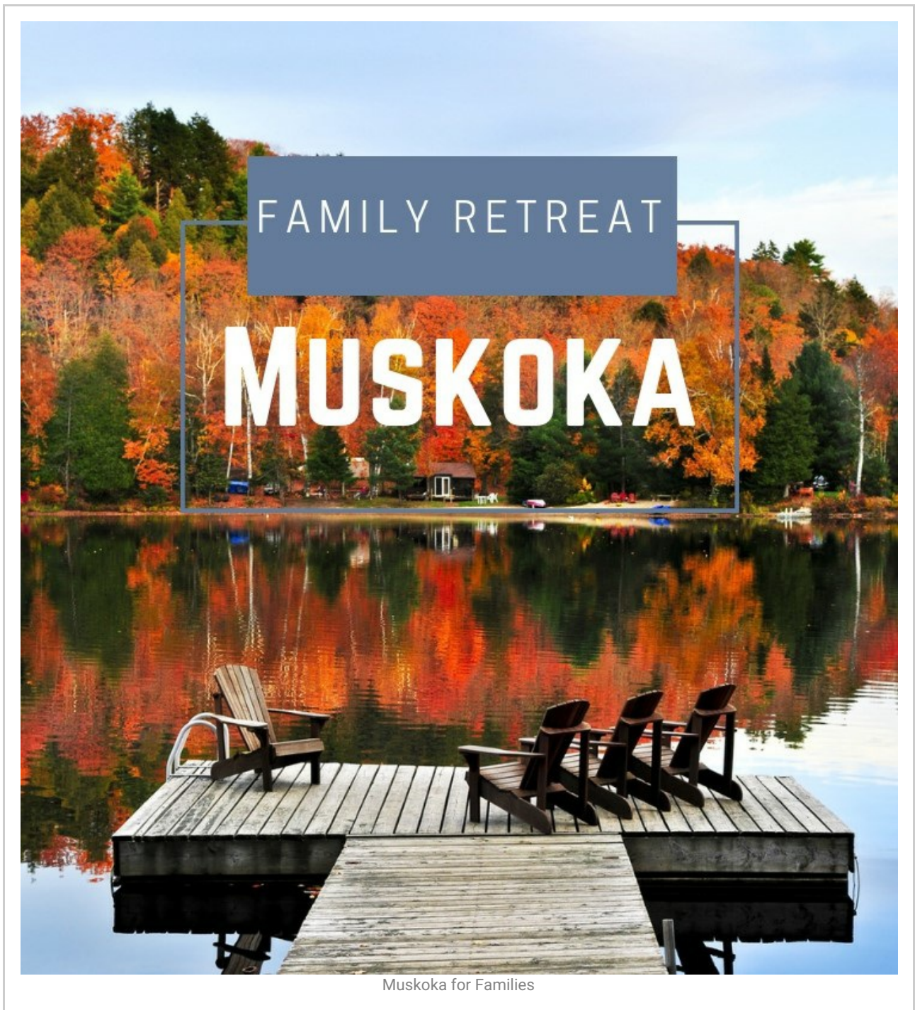
Muskoka for Families

Muskoka! If you know the area, you know its magic. If you haven't been there, take the whole family to reconnect and prepare to be enchanted.