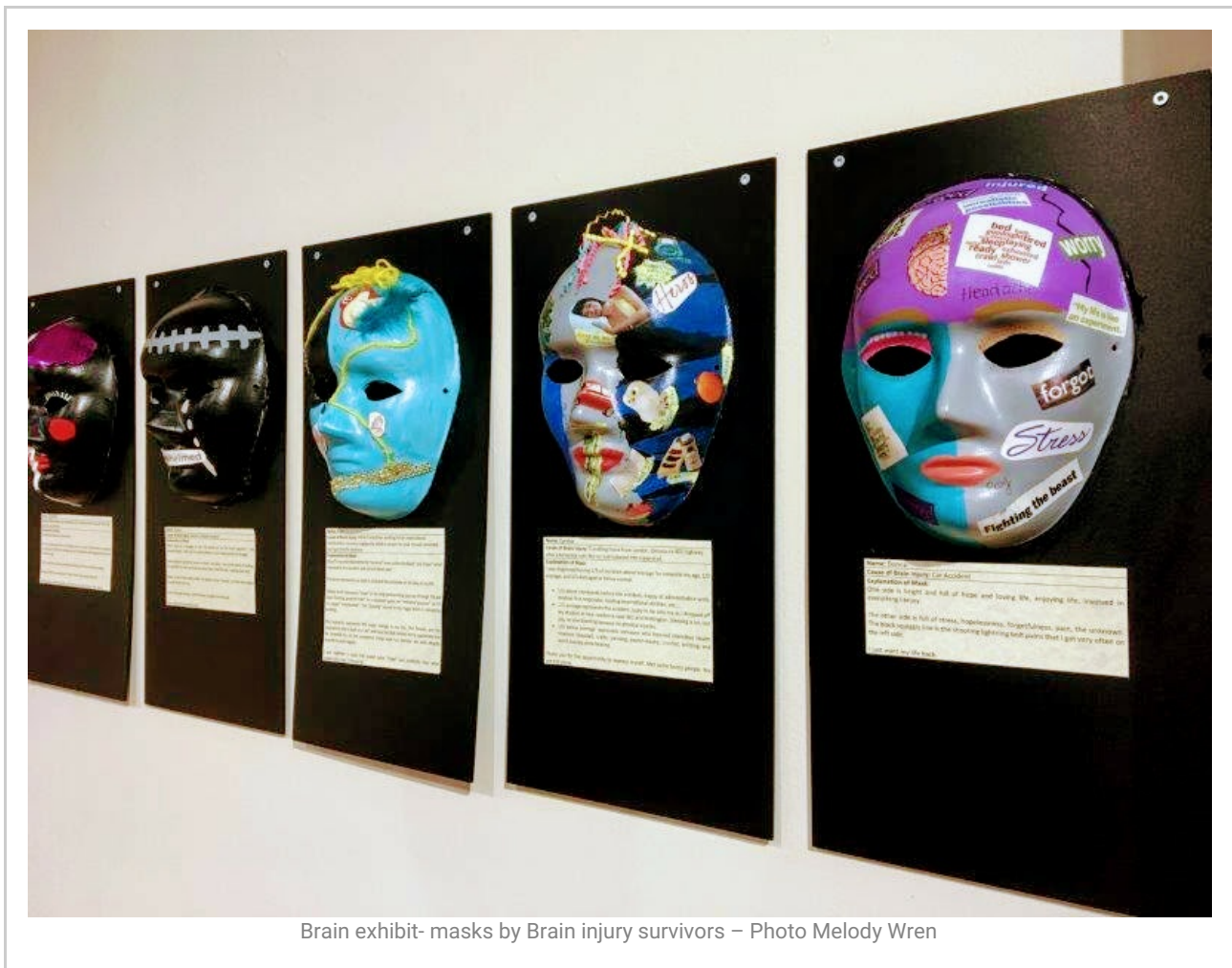
Brain exhibit- masks by Brain injury survivors

We checked into the recently renovated Crowne Plaza , with its fun lime and turquoise lobby furniture, king-sized beds and lime coloured bathrooms. An iPod charging station on the night table and a “wind down-rest up” package of face wipes and lavender spray ensure a restful sleep.