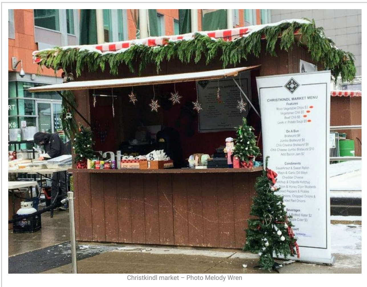
Christkindl market

Christkindl Market is a traditional outdoor market adjacent to city hall and the skating rink with a European feel to it. Stalls selling hats, sweaters, finger puppets and lots of hot drinks and food added a festive feel to downtown Kitchener. I bought flax seed neck warmers for gifts for friends, and hand knitted finger puppets.