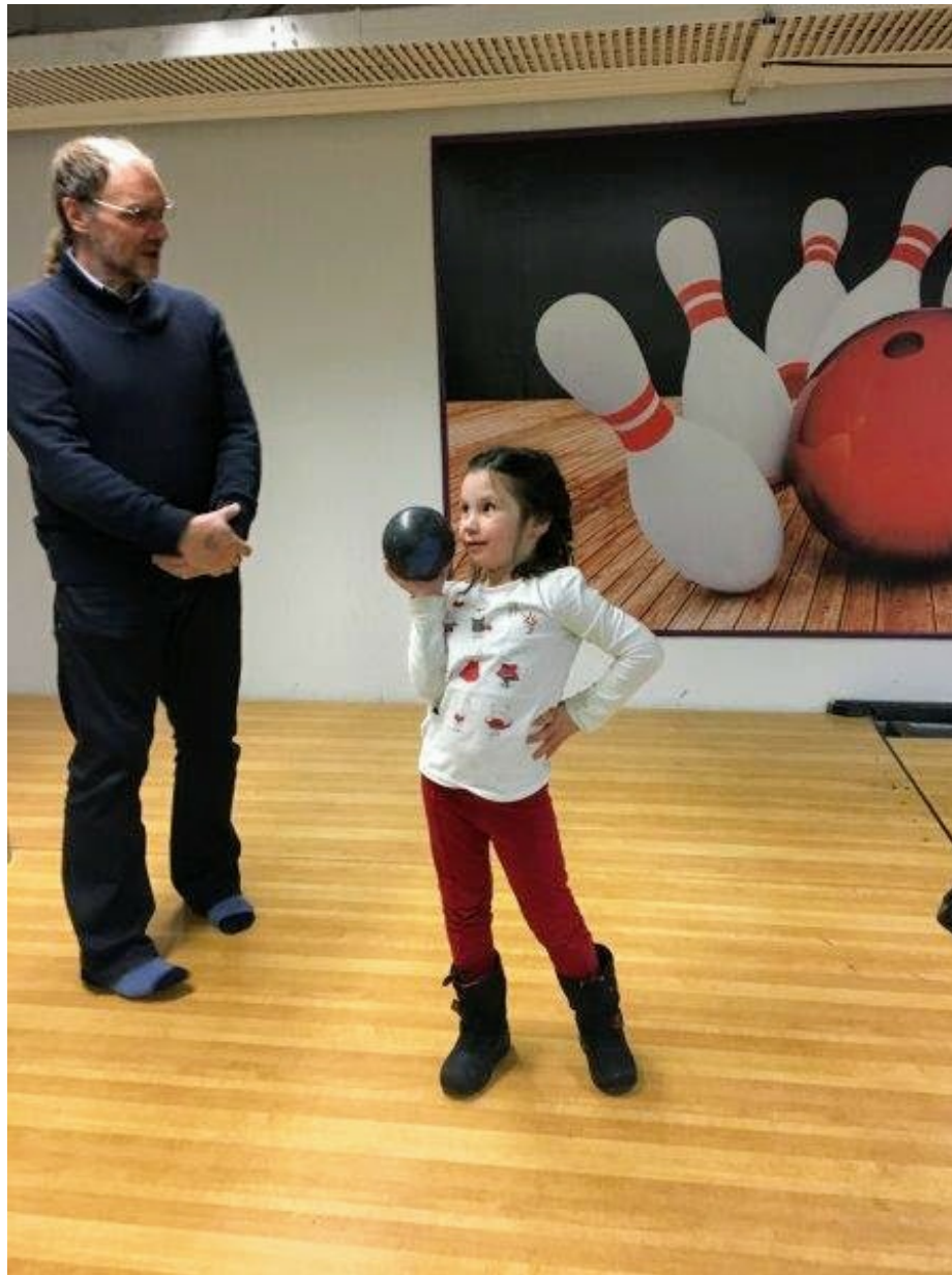
Bowling with Grandad at the Crowne Plaza

After a full hot breakfast buffet at the hotel, we made our way to ride the Santa train on the Waterloo Central Railway . The vintage train filled with the excitement of a visit from Santa. We sang Christmas carols led by the conductors and Santa's elves and gobbled up a delicious boxed lunch we carried on board from E.V.O. Kitchen in nearby Cambridge. Santa gave each child a beautiful silver bell on a burgundy hanger that they then rang along with the carols. Colouring books and crayons were handed out, and at only one hour long, it was filled with Christmas activities to keep both grand-daughters, 5 and 4 1/2 entertained the entire time.