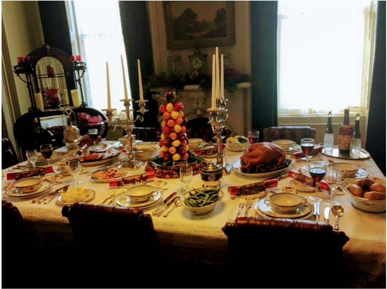
Castle Kilbride Christmas Dinner