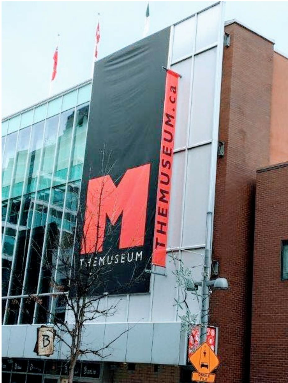
THE MUSEUM