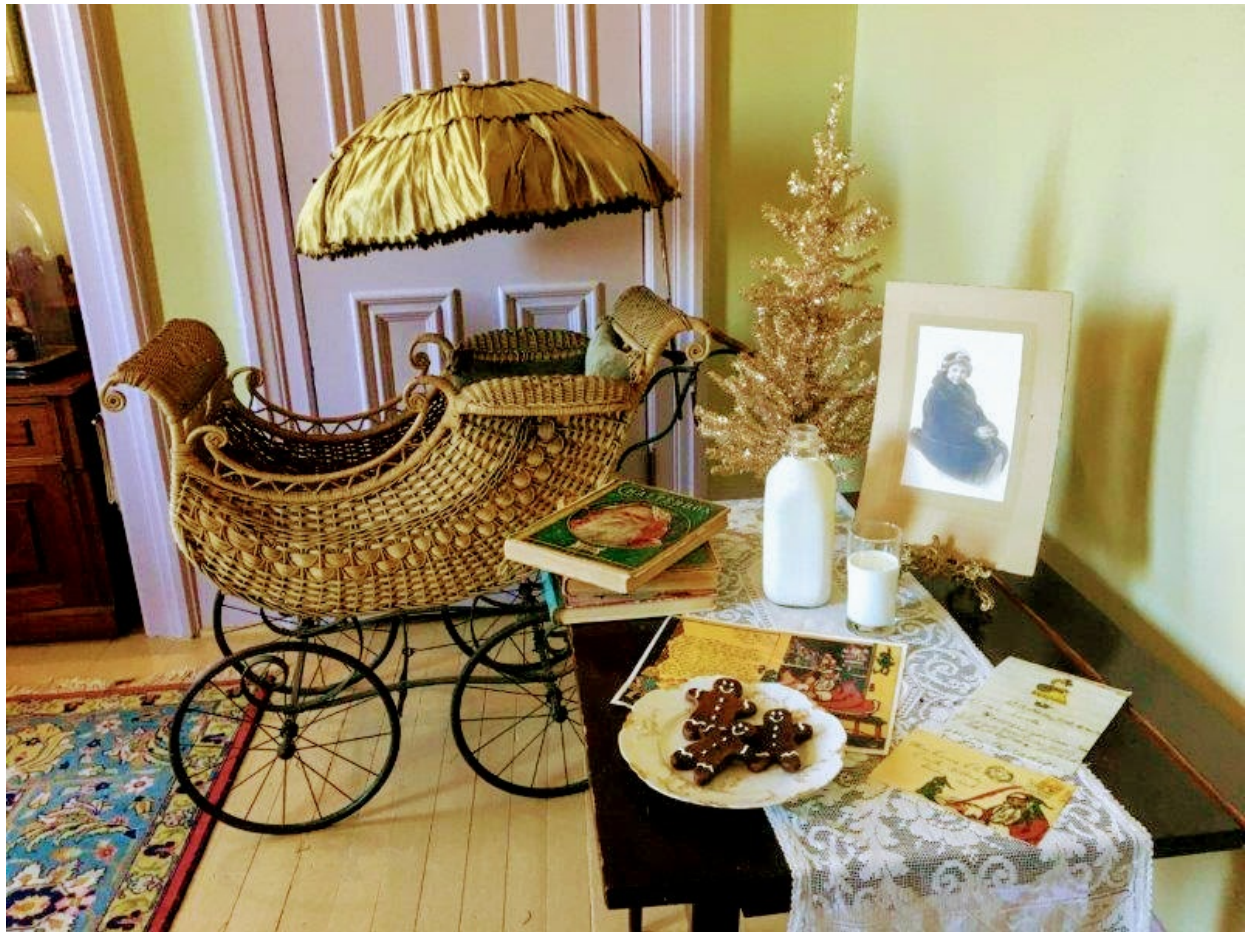
Castle Kilbride Cookies and milk for Santa

The whole weekend was enjoyable for every layer of the family, hitting all the elements of a weekend escape nearby. Our five-year-old grand-daughter announced that she wanted to live at Castle Kilbride and never leave.