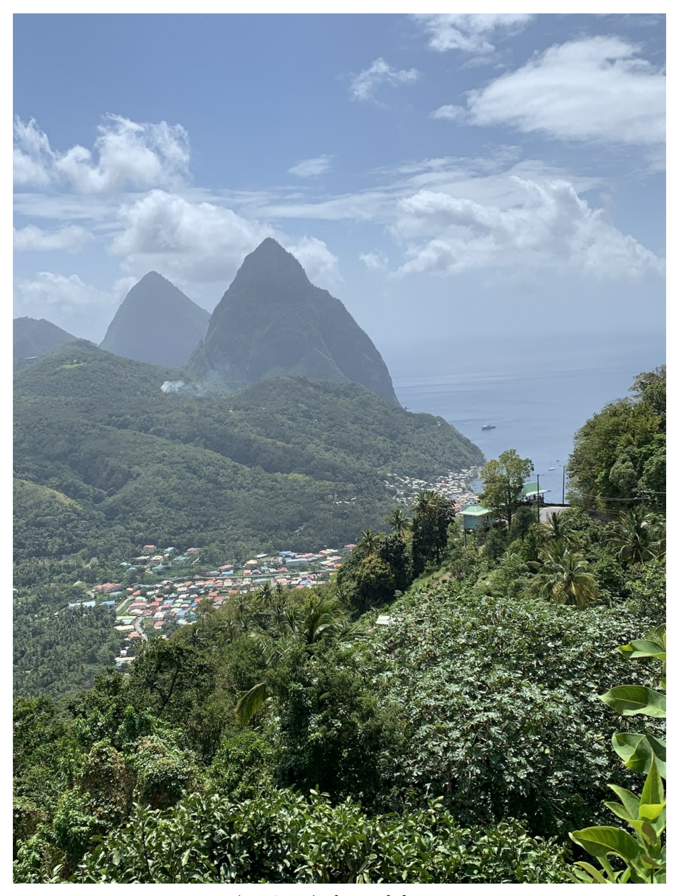
Pitons St Lucia

Accommodations feature a family section as well as an adult-only section so everyone is