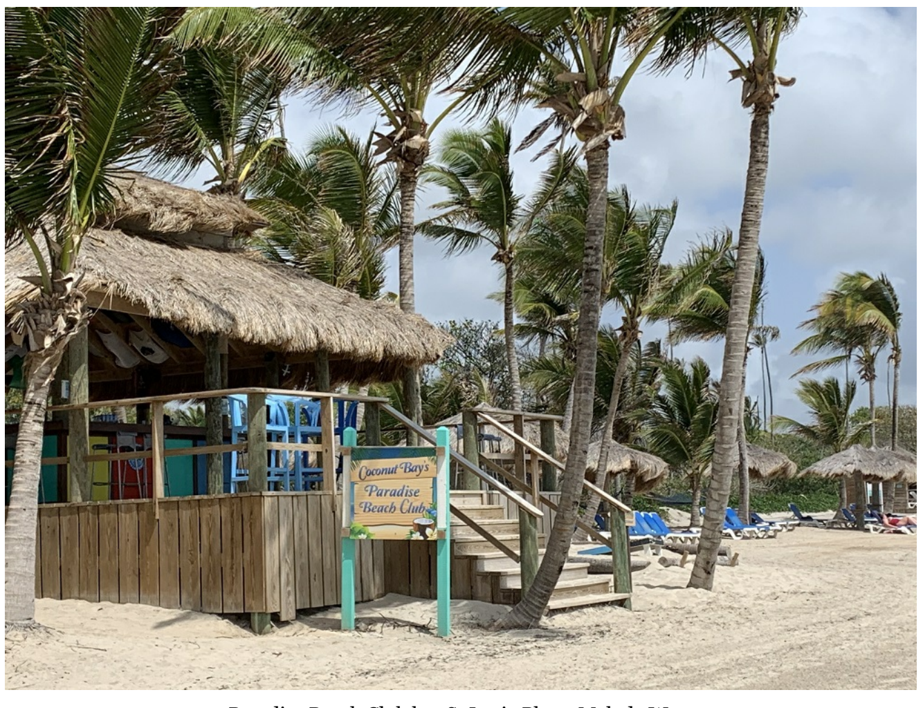
Paradise Beach Club bar St Lucia

There is a tour desk in the front lobby to arrange local tours with a list of Covid-19 certified tours. I would recommend the Catamaran Sea and Land Adventure offered exclusively to the guests that sail to the Pitons and has several opportunities to snorkel in locations around the island as well as a visit to the Soufriere Volcano and Sulphur Springs. Any tours have to be booked 24 hours in advance.