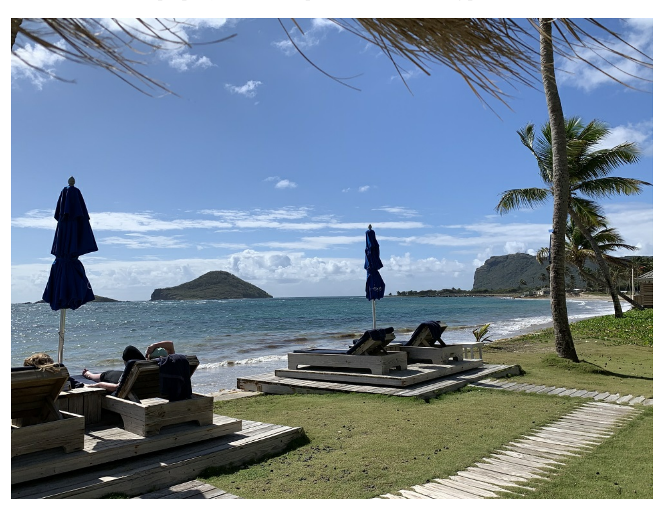
Poolside loungers with a view of Maria Islands St Lucia

For a bit of pampering (that we all need right now) is the Kai Mer Spa. Ocean views from every room, the full-service spa offers massages, waxing, scrubs and wraps. A scrub with locally grown St. Lucian chocolate is a favourite as is the local coconut oil used in every massage. Locally grown Aloe Vera is also used in several treatments. Separate private cabanas are reserved for couples massages, each with a beautiful view of the ocean and the Maria Islands are visible in the distance. Popular with honeymooners, many of whom have been married on the property with the help of an onsite wedding planner.